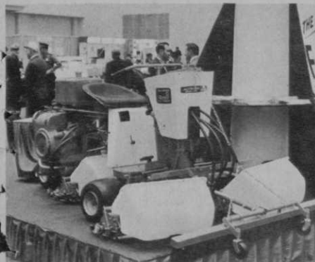
Left to right: Jacobsen, Toro and Hahn-West Point