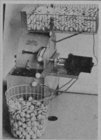
JUNIOR BALL WASHER