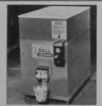
GOLF BALL DISPENSERS

Smithco, Inc., introduces the Spray Mate spray outfit for spraying greens and tees and other special turfgrass areas. It consists of a 65-gallon tank, a Hypro pump capable of developing 500 pounds pressure, a nozzle, hose and 15-foot boom. It is completely self contained on four wheels so that it can be pushed into the back of the continued on page 86