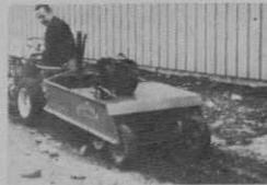
NEW PIXTONE "Junior" made for use with lawn and garden tractors. Picks stone up to 4" dia. from 28" swath

All PIXTONES have exclusive revolving arm and rake that not only removes stone and trash, but aerates, pulverizes and blends soils for ideal seed bed. Hundreds in use by golf courses, parks, nurserymen, landscapers, beaches, etc. Contact manufacturer for complete details.