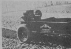
PIXTONE "Standard" picks stone and trash 3/4" to 9" dia. from 40" swath.