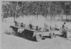
PIXTONE "Tandem" Three "Standards" hooked up in gang for fast 9-ft. coverage on big acreage.