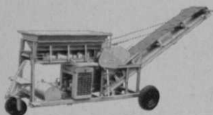
L-25, L-40, L-60

Easy to use and easy to move, there is a Lindig with the feed, capacity and discharge capabilities your operation requires.