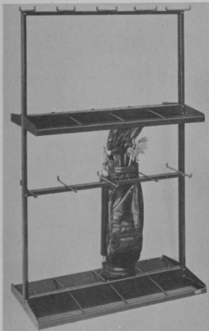
U.S. & CANADIAN PATENTS

Your members will like the extra convenience and care. Your pro shop profits from 40% more space these racks make available.