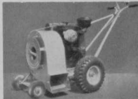
SELF PROPELLED MODEL

ATTACHMENTS: 10 foot 6" dia. Hose puts blast at places hard to reach or clean; Forward Deflector for curbing or walls; Highway Joint Deflector; Snow Blade; Bio-Wash Unit.