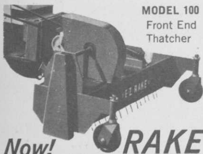
MODEL 100 Front End Thatcher

For more information circle number 174 on card