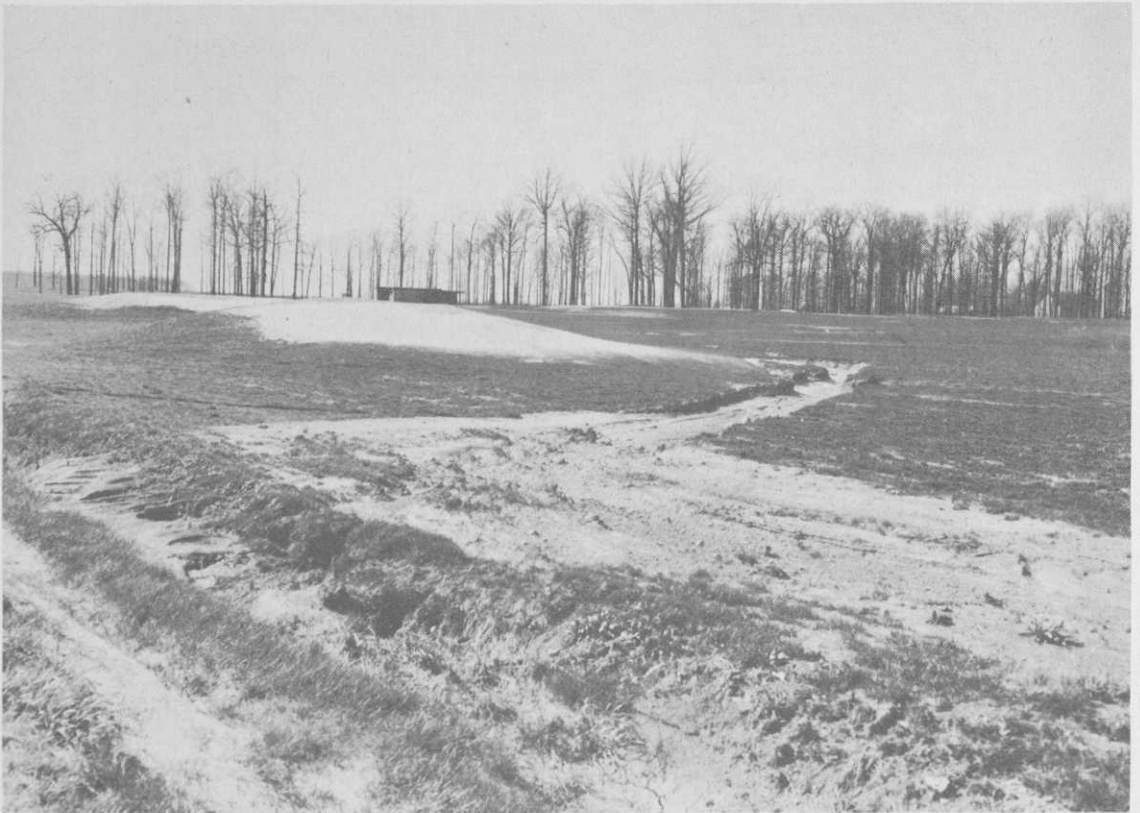
Erosion of newly seeded golf course can be seen around sand trap, and in filling of road ditch.

S uperintendents, if hesitant about asking fellow supers for advice, can go to the local soil conservation service unit of the United States Department of Agriculture. The following is a brief case history of the help the department gave to Sidney, Ohio with its course.