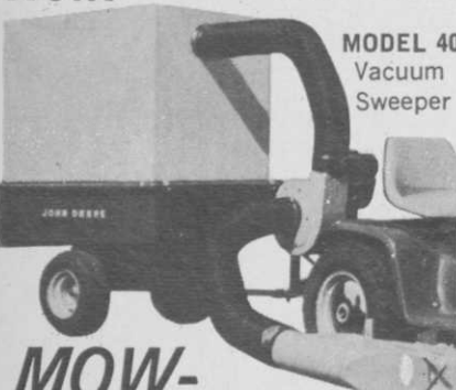
MODEL 40 Vacuum Sweeper