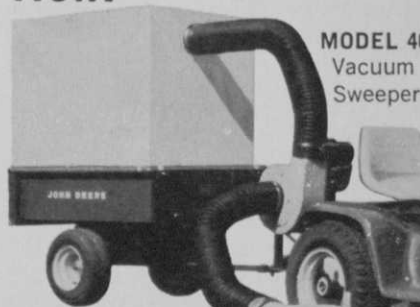
MODEL 40 Vacuum Sweeper