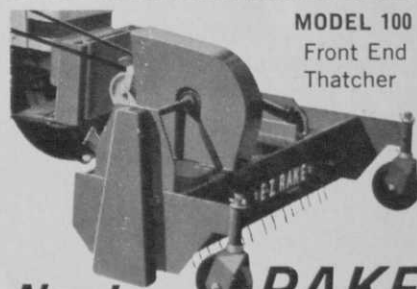
MODEL 100 Front End Thatcher

For more information circle number 197 on card