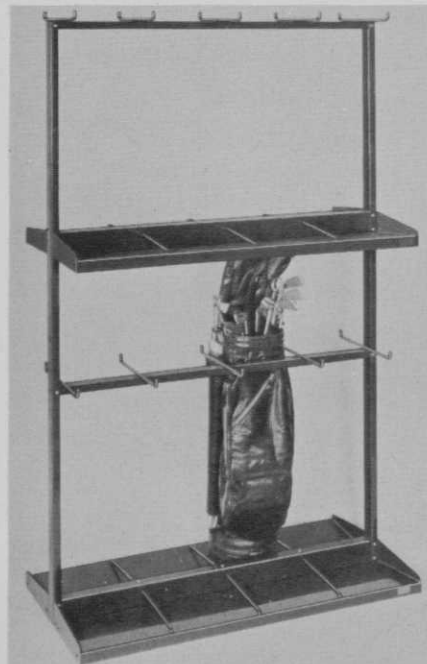
U.S. & CANADIAN PATENTS

Your members will like the extra convenience and care. Your pro shop profits from 40% more space these racks make available.