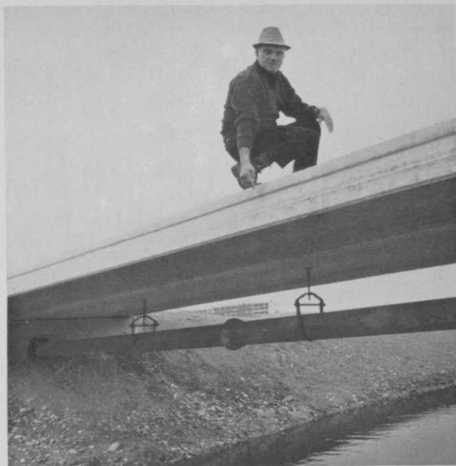
This 8-inch cast iron pipe main supplies all the water for the course. Extending from the pumphouse beyond the bridge, it connects to the 6- and 4-inch cast iron tributaries.

No gimmicks of any kind. This is definitely a championship course, and management plans national tournaments here. You'll be seeing a Playboy Open on network TV someday! Our second course will open in June, 1969.