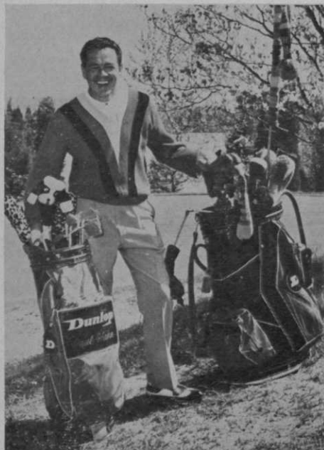
For information on the PAUL HAHN SHOW Write: Dept. G.G., Box 691, Cape Coral, Florida For more information circle number 150 on card