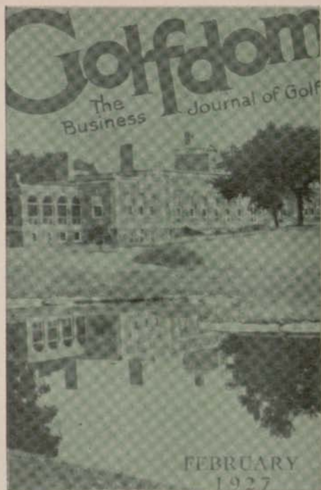
Cover of GOLFDOM'S first issue.

Review GOLFDOM during the '30s and you see the merchandising educational programs that put the foundation under every successful quality sales campaign by the golf playing equipment manufacturers today. The pro at the private club is in a unique position to plan, conduct and appraise a quality merchandising campaign. He has the select market of buyers whose purchases influence all other buyers and he can closely appraise results of the advertising and the appeal of the merchandise. GOLFDOM kept on showing how these advantages worked out for benefit of the pro and the smart manufacturer who worked with the pro.