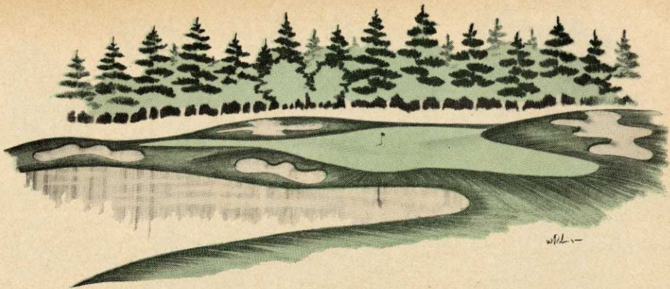
Pond adds to playing interest of 4th green. North Course, Stow Acres, Mass.

lated are these three that they can be depicted as the sides of an equilateral triangle—in this case, a triangle of basic considerations. No course or any feature of it is a true success unless all sides of the equilateral triangle have been used.