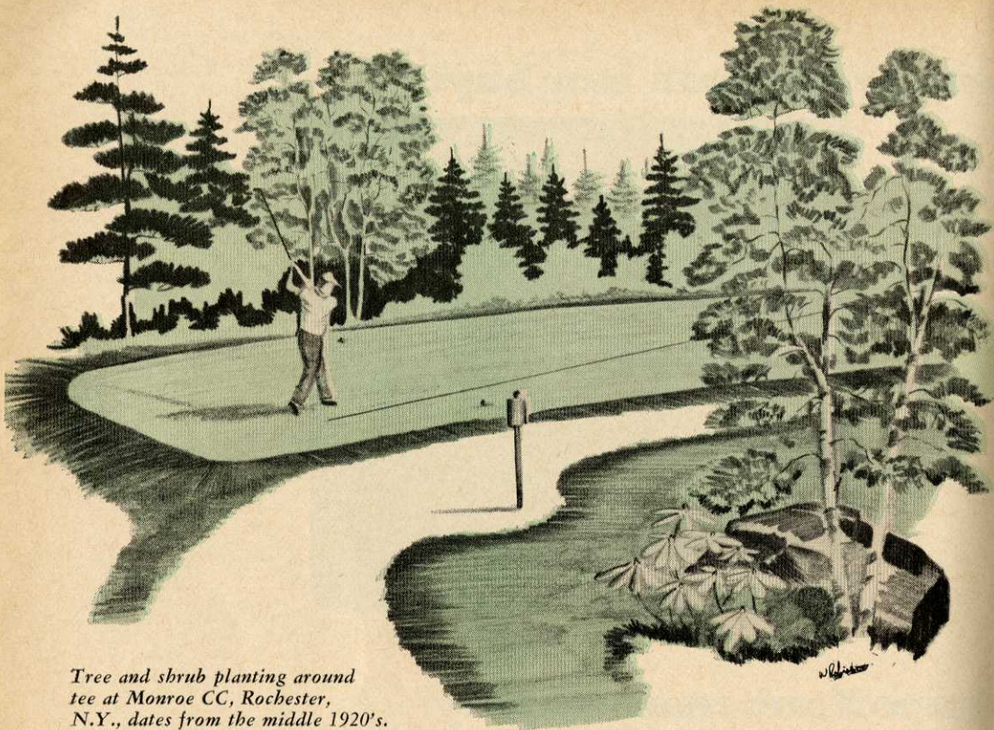
Tree and shrub planting around tee at Monroe CC, Rochester, N.Y., dates from the middle 1920's.