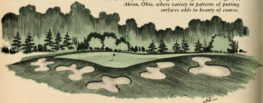
Small, kidney-shaped traps guard 3rd green at Portage CC, Akron, Ohio, where variety in patterns of putting surfaces adds to beauty of course.

The golf courses of this continent are indeed examples of man's work that complement rather than detract from Mother nature's handiwork.