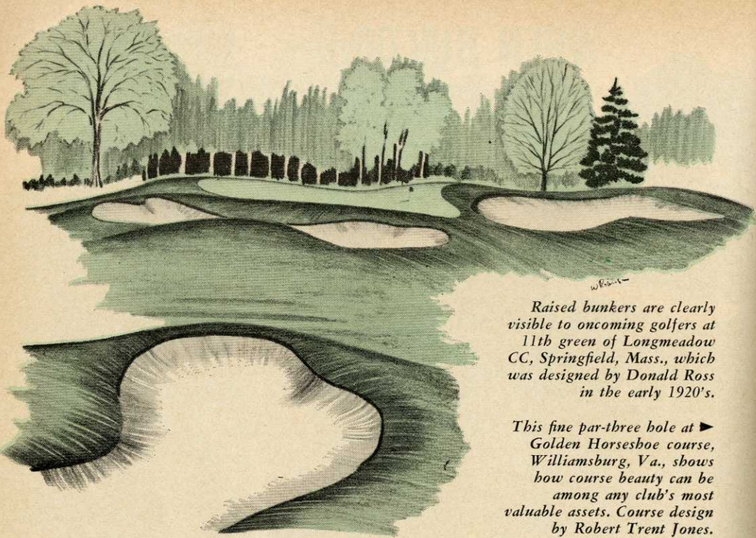
Raised bunkers are clearly visible to oncoming golfers at 11th green of Longmeadow CC, Springfield, Mass., which was designed by Donald Ross in the early 1920's.