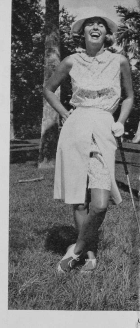
Left: Izod gold bermudas of arnel and rayon ($14.50), Munsingwear mesh shirt ($5), Foot-Joy shoes ($42.50).

Right: green and white striped Munsingwear shirt of cotton and antron nylon ($7), DiFini bermuda ($12.95), Foot-Joy shoes ($42.50). Gold Puritan ban-lon v-neck shirt ($9), gold and white seersucker slacks of dacron and cotton by Gino Paoli ($19.95).