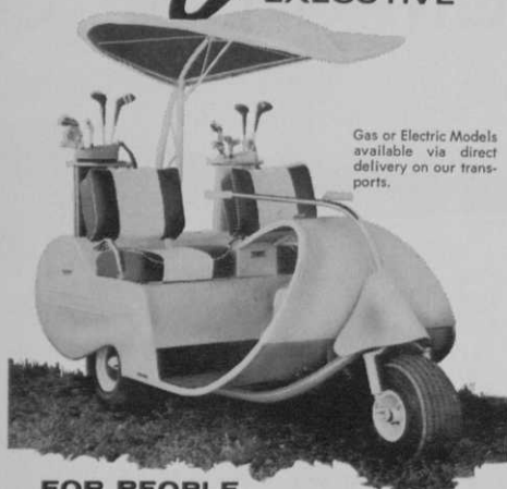
Gas or Electric Models available via direct delivery on our transports.