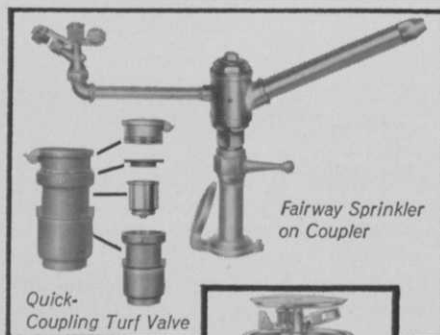
Fairway Sprinkler on Coupler

THE SKINNER IRRIGATION COMPANY 415 WATER STREET, TROY, OHIO