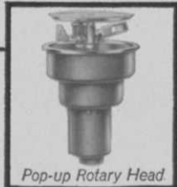
Pop-up Rotary Head