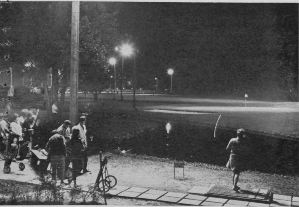
Players at Par-3's like to feel everything at the course is as fine as at the better clubs.