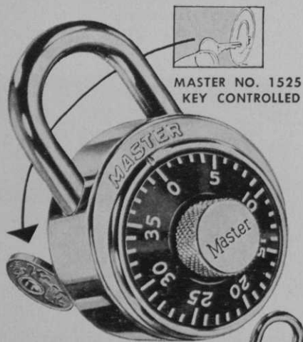
MASTER NO. 1525 KEY CONTROLLED

Each padlock has its own combination, yet your control key opens every one! Ideal for use in humid locker rooms — cadmium rustproofing and stainless steel case. Low initial cost . . . no installation expense . . . long-lasting, trouble free service.