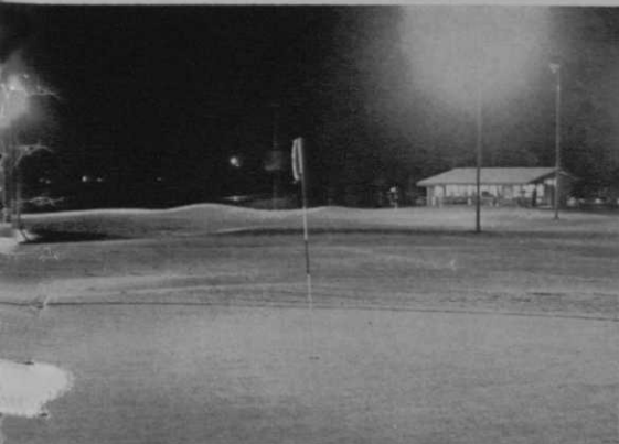
Indio put a little extra into its lighting system and near daytime brightness is the result. Some people call the course "the oasis in the night."