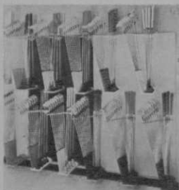
Dual Space Saver Display Racks for peg board or wall mounting. Easily mounted.

(See Pg. 101 for Quality WITTEK Ball Pickers)