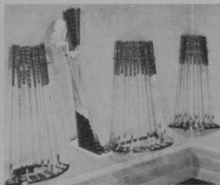
Self-Selector Racks may be used on flat walls or peg board. Perfect where floor space is limited.