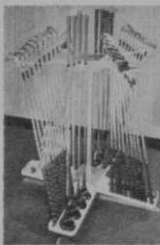
Revolving Island Dual Rack displays 4 sets of woods, 4 sets of irons.