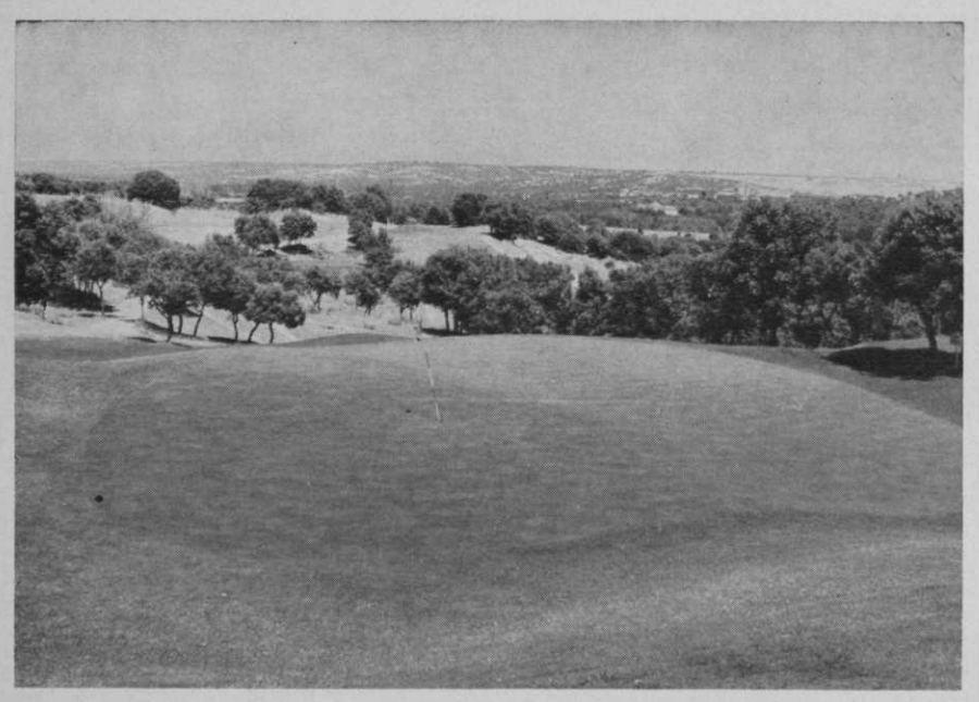
Greens, around 8,000 feet square, at Soto Grande have been planted to Penncross. Gibralter can be seen from this spot on a clear day.

that every hole is a challenge when played from the back. But they are a fair test for the average golfer when the markers are placed up front.