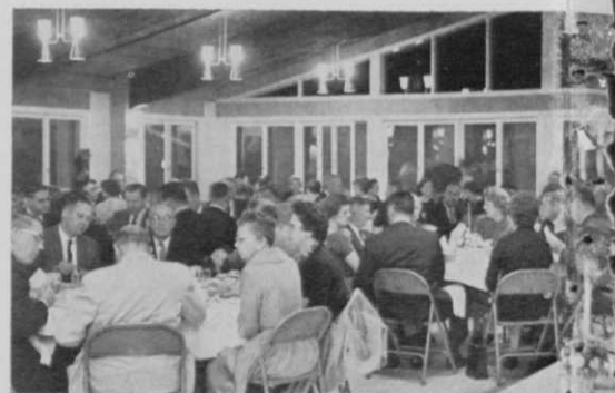
Muny sponsors and officials get together every year for banquet in Swartz Creek clubhouse.

Another means of winning public approval has been the introduction of a putting green at the city's annual indoor yard and garden club show. The muny golf department also issues passes to the press, radio and television on a limited