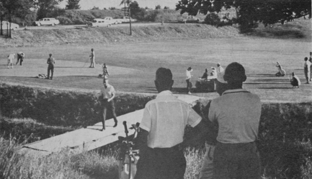
Fair size crowds always turn out for Flint's City Amateur. Here is 9th green scene at last year's event at Kearsley GC.