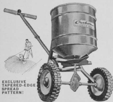
EXCLUSIVE TAPERED-EDGE SPREAD PATTERN!