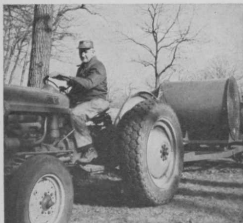
Len Ainey, who has been a big help in the development of Timber Trails blower, mans tractor in cleaning up the rough.

For two or three seasons, Bartlett went along with the idea of sweeping the course with a chain link fence attached to a tractor. It worked quite well when the leaves were dry, but when they became wet and matted, the fencing didn't do much of a job of picking them up. Two 80-inch mulchers purchased in 1960 were effective enough in reducing the leaves to chaff, but it took at least an hour for them to cover a single fairway. Since 16 of the 18 holes at Timber Trails are bor-