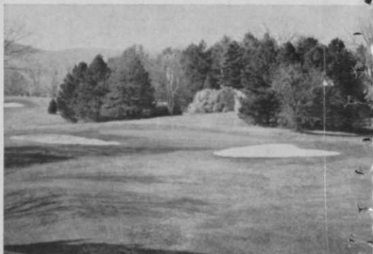
This green has been continuously in use at Stockbridge for nearly 70 years. It may be the oldest in the U.S. It's now the 16th, was the original second and later No. 7.

Also of interest is the established fact