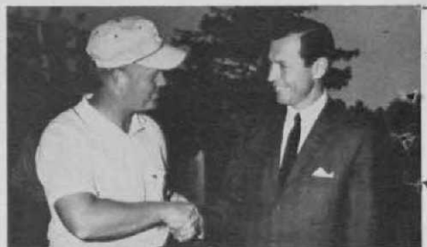
Jack Nicklaus, Masters winner, presented a set of MacGregor woods and irons to Carl Sanders, governor of Georgia, before the Augusta classic got underway. MacGregor has plants in Albany and Covington, both in Ga.

Write for prices: Turf Dept. RIDER NURSERIES & FLORAL CO. Farmington, Iowa