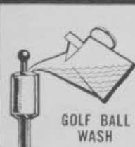
GOLF BALL WASH