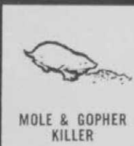
MOLE & GOPHER KILLER