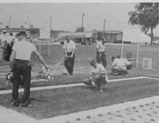
A group of Midwest supts. show great interest in Merion turf that is being developed for backyard putting greens.

Denver. So, altogether there are about 3,000 acres on which Warren's bluegrass, zoysia and bent sod and stolons are produced. With its roots in the loam all the way from Denver to New York, the nursery's sales are primarily to golf courses and landscape contractors between the Rockies and the Atlantic coast.