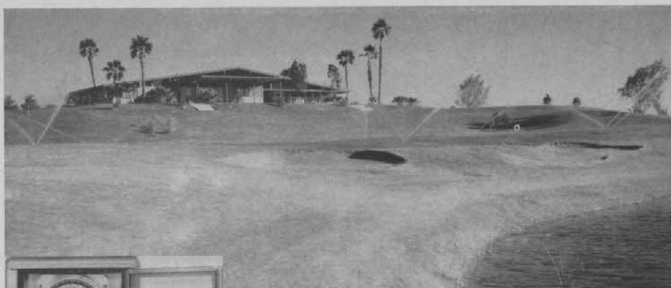
18TH GREEN, BERMUDA DUNES COUNTRY CLUB. PALM SPRINGS, CALIFORNIA

(1) The club accounting system often leaves much to be desired in giving an accurate picture of course costs. Much