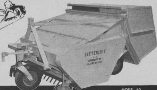
MODEL 60 Tractor mounted unit with self dumping hopper

Three Point or Universal . . . . Available as standard equipment.