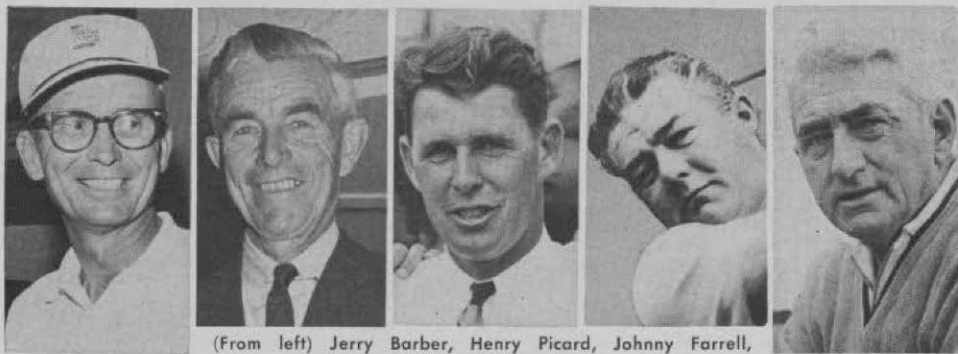
(From left) Jerry Barber, Henry Picard, Johnny Farrell, Lawson Little and Tommy Armour.