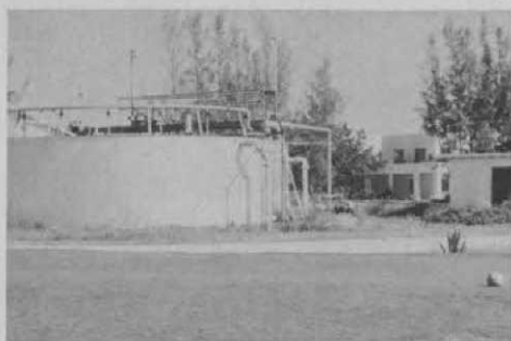
(Above) Reconversion plant filters 50,000 to 75,000 gals. of water a day, feeds it to lakes on the fifth and sixth holes. (Right) This is one of three traps at the eighth green. Clubhouse in background resembles Tara Hall of "Gone With the Wind" fame.