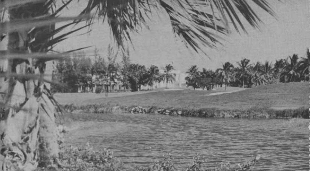
There's water, water everywhere at the Grand Bahama Hotel course as the golfer encounters seven Lakes in making the 18-hole round.