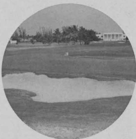
Persons who have seen No. 2 fairway and green say the scene reminds them of Pebble Beach's 17th.