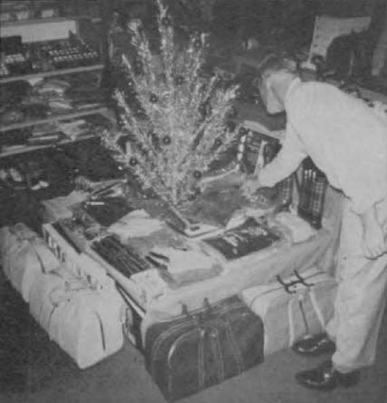
Gift selling revolves around island display at Tom Case's shop at Sedgefield in Greensboro, N. C.