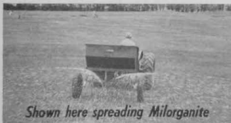
Shown here spreading Milorganite

Spreadability brings you green fairways, shining turf... that make a golfer feel he's on the world's best course! Spreadability is an even flow, an accurate spread pattern, and a broad cast. But spreadability goes further... into the extra thought in engineering design to bring you: less maintenance, longer life through fewer moving parts, all unenclosed; ease of feed control from tractor seat; capability to handle tough spreading jobs; fewer re-fills. All of this is spreadability . This is the Larson Broad-Caster.