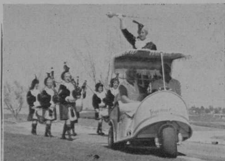
Members of the Scottish Dagenham girl pipers, with a batoneer aboard a golf car, were among those who took part in the parade that marked the official opening of the Tropicana CC in Las Vegas in September.

One large Eastern club lists quite an extensive catalog of thievery and vandalism that it has been subjected to in the last two or three years. Hose, tee markers and other equipment have been stolen, fir trees have been cut down and stolen at Christmas time, and vehicles and ponies have been driven or ridden across the greens. The pro shop has been burglarized and there have been thefts of members' equipment from the lockerrooms. Quite a few hub caps have been removed from cars in the parking lot and this year a new automobile was stolen from the lot, used in the robbery of a store and finally wrecked when police pursued and caught the thieves.