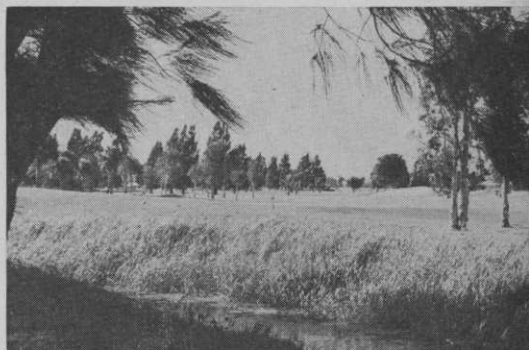
(Above) Players who stray off this fairway at Plantation GC in Ft. Lauderdale find themselves in the bullrushes. (Left) 12th green at Coral Ridge has a bi-level contour.