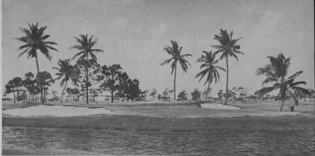
Many players say 16th hole at Coral Ridge CC in Ft. Lauderdale is one of the prettiest they've seen. But that's only after they've escaped safely across the water in front of it.