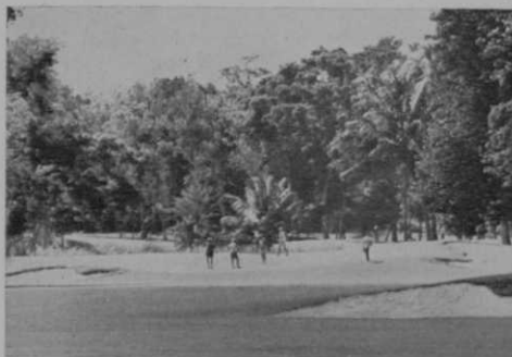
Every hole at Dorado has classical look.

We were slightly under these figures as we had to slow up due to the dry weather. The greens were watered nearly every