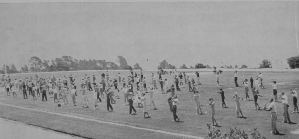
Mass swing session at All-Golf clinic is held on Carmel High Athletic Field in Monterey, Calif.