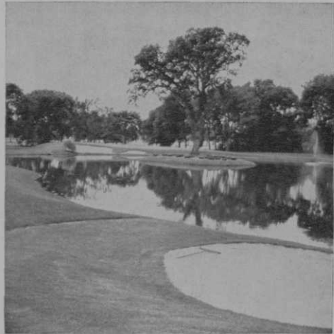
When day's work is done, the students can sit back and take in such exciting views as these. Bob O'Link is one of the most beautiful courses in the Chicago area.

young men to the practical side of greenkeeping. About 70 per cent of them have remained in golf course work and all in turf work of some kind. More than a handful of Williams' proteges now are supts. at various courses throughout the country and possibly a dozen are working as assistant supts. or foremen. One is a pro-supt.