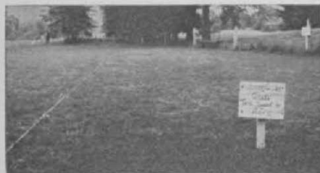
Rope and sign on practice tee at Merion.

Yardage, par information on looped steel rod at Rosedale in Toronto.