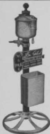
PAR AIDE JR. AND SR. GOLF BALL WASHERS AND ACCESSORIES