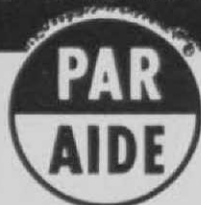
EASY TO STACK PAR AIDE BENCHES