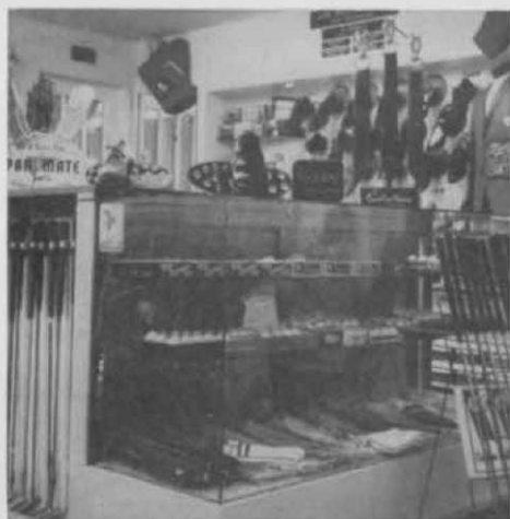
(Upper right) Shirts and rainwear are displayed in individually marked section for easy selection. Mirror gives added flourish to lighting effects.