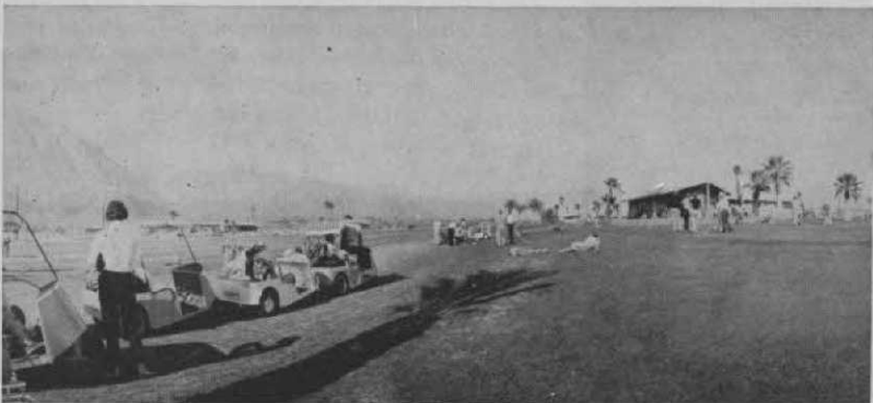
(Above) Exquisitely groomed grass, exciting mountain backdrop dazzle golfers at DeAnza Desert CC. (Below) Car traffic on the first tee. Clubhouse is at right.