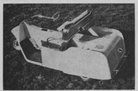
The Caddy Car Eagle

Caddy Car golf cars are now being made by sister companies in Tex. and Mich. They are Powered Products of Texas, wholly owned sub-