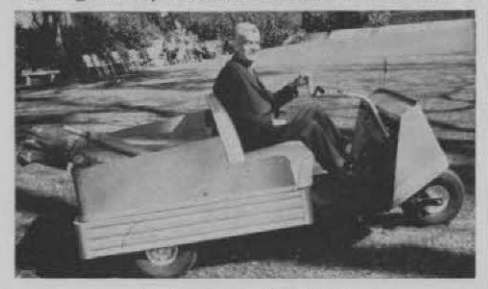
Victor's new Model 37.

Victor Adding Machine Co., 3900 N. Rockwell st., Chicago 18, has begun production of its 1960 golf car, Electri-Car-Model 37. A Victor-