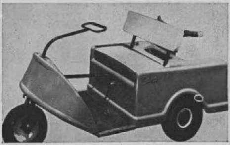
The Caddy Car Birdie

All gas-powered Caddy Cars are powered by Kohler engines. A great deal of engineering re-