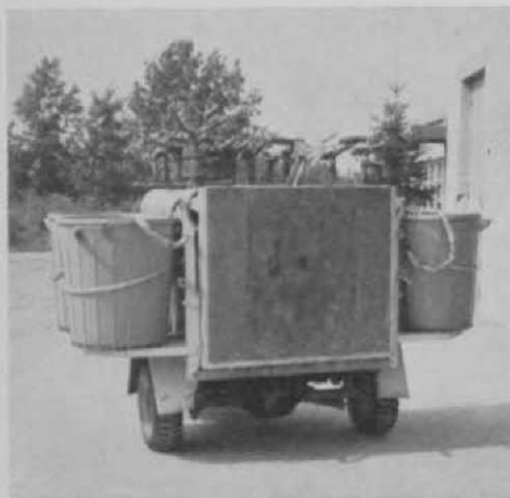
Loaded mower in Cushman pick-up. Four baskets are for grass clippings. Sprinklers are placed in circular openings in section of large size plastic pipe.