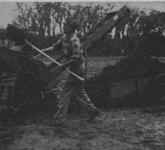
Tifton 57 Bermudagrass sod was shredded in Wichita Grinder for fairway planting at Fernandina, Fla.