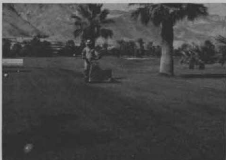
The secret of good Bermuda tees is close cutting with heavy duty mower with grass catcher as at Thunderbird in Palm Springs.