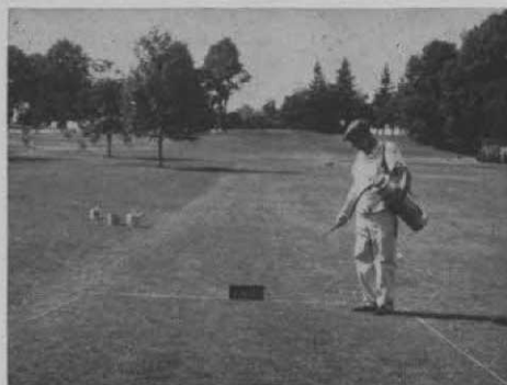
Yarrow control after one application of 2,4,5-TP on plot in rough at Milwaukee CC.

Pregerminated seed has been used in Iowa, Philadelphia, and at West Point. The method is simple. The seed is mixed with two to three times its volume of Vermiculite and kept moist for from four to five days at a constant room temperature of 70 deg. F. The test area should be aerified and cross-disc'd often enough to prepare a good seedbed. The moist seed mixture should be dried by mixing with an equal volume of Vermiculite or sewage sludge. The seeding rate of 80 lbs. per acre (2 lbs. per 1,000 sq. ft.) may seem liberal. Carl Bloomfield uses 100 lbs. per acre of Bermuda seed in the Rose Bowl every year. The Bowl is used fourteen to sixteen times every fall. There is a month after that to prepare for the New Year Day Game. Turf on the field has been good all fall and perfect always on New Years Day.