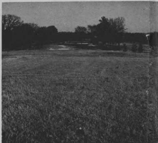
Dense Bermuda rough came fast at East Lake after liming, fertilization, and periodic spraying with arsenicals to check crab.