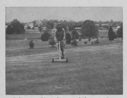
Delmonte raking of greens before mowing.

New Pennlawn fescue in disc slits. Seeded into fairway fall of 1959.