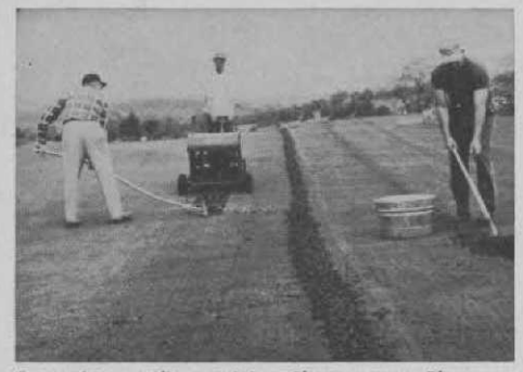
Operating aerifier on West Shore green. Plugs are pushed aside, placed in bushel baskets and deposited in dump truck.