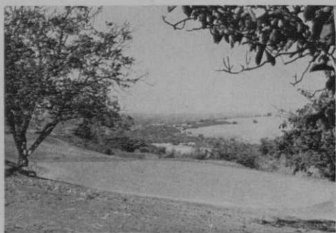
Fifth green at Redwood City Elks club course overlooks Palo Alto and San Jose.