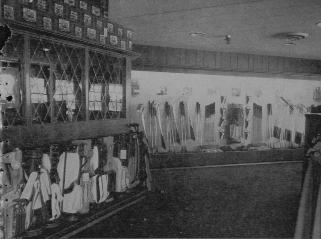
Tees are used to spell out coming events in open pegboard area above club display. Large cases at left with latticed windows can be used for a variety of displays. Golf bags are on platform above floor level.

in treatment of customers, no matter how exasperating the latter may be, is unpardonable.