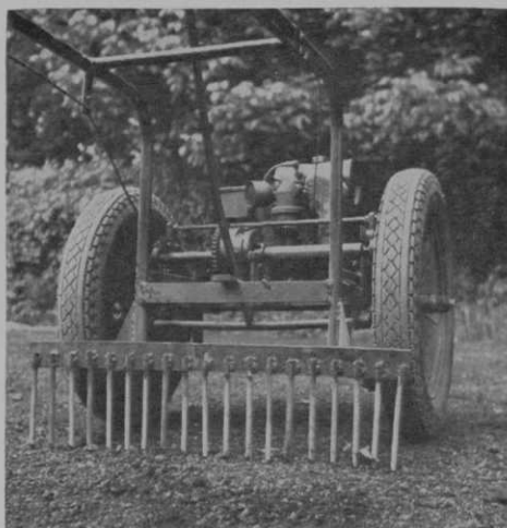
This power driven bunker rake is used by Supt. Nelson Monical at Portage CC, Akron, O. Monical designed the rake.

What is the answer? Where do we go from here? Every architect is thoroughly familiar with the need for, and the benefits of, good drainage. What is the factor that permits new courses to be built on heavy soil with no drainage under the greens? It is puzzling. It is something like courses where the turf is poor because it is starving for nitrogen. When we recommend the feeding program that will feed the grass properly to produce good dense playing turf, the question arises, "What